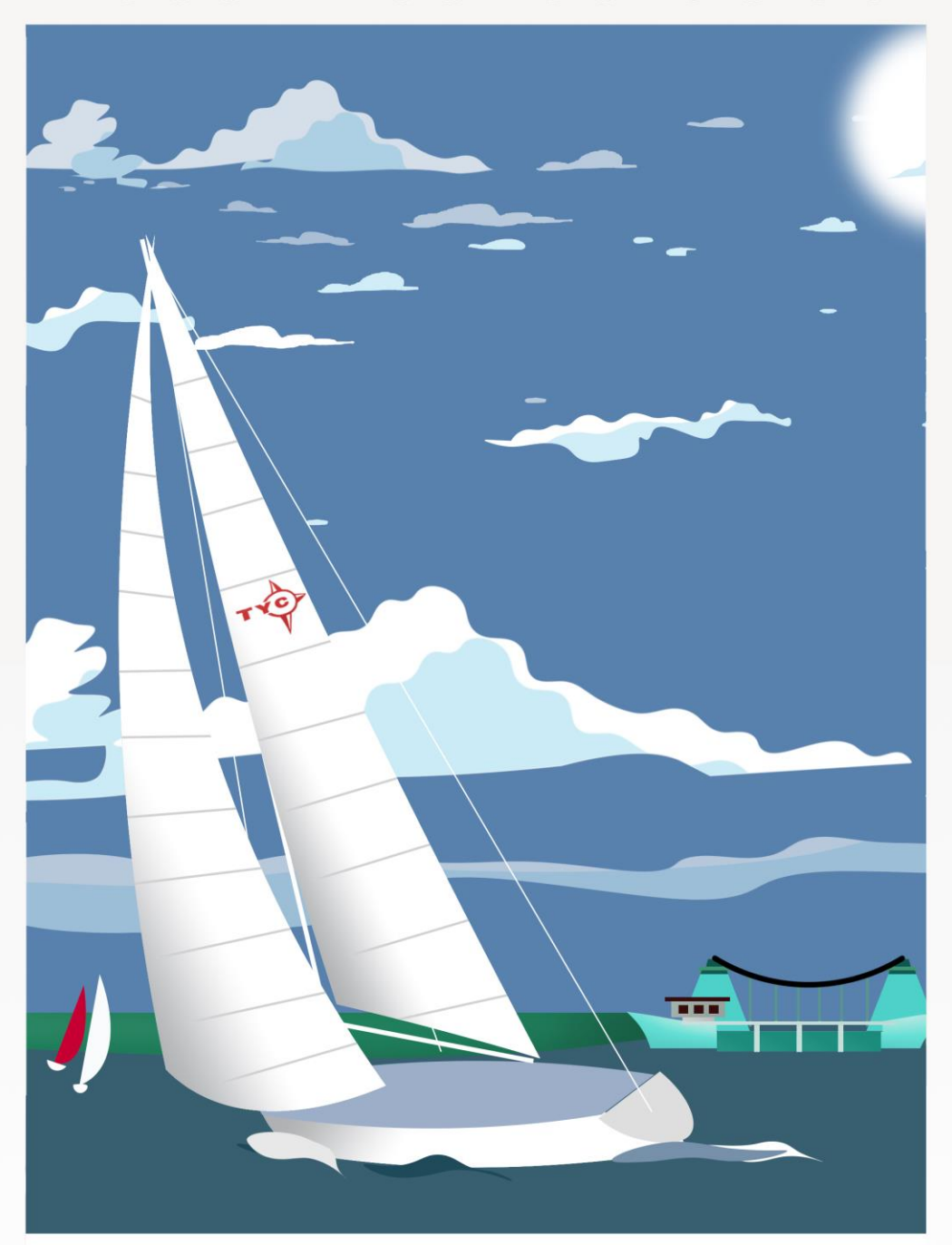
Commodore's Cup • June 05, 2021 Keyesport, IL